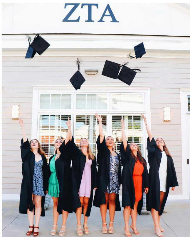
Some of the 2020 graduates celebrate.

The panel will take place at 6:00pm on Tuesday, November 30th, at the Theta Zeta house on Wofford's campus. If you'd like to participate, please contact us by shooting over a brief email . Please be sure to mention your current job title and industry, as well as any other